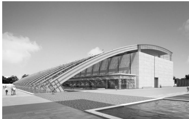
Figure 1. Rendered image of the main buildings complex at ELI-NP: laser building, accelerator and experiments building, laboratories building.

The Nuclear Physics pillar, ELI-NP, located near Bucharest, Romania, in the Măgurele Physics research campus, is scheduled to enter operation in 2017.